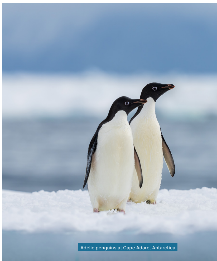
Adélie penguins at Cape Adare, Antarctica

This map is a guide only and is subject to change due to permitting and regulatory approvals; and weather, sea state and other conditions beyond our control.