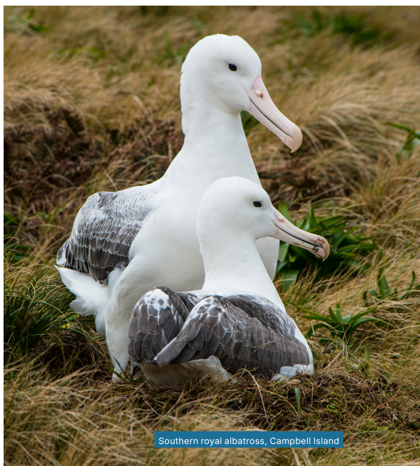
Southern royal albatross, Campbell Island

This map is a guide only and is subject to change due to permitting and regulatory approvals; and weather, sea state and other conditions beyond our control.