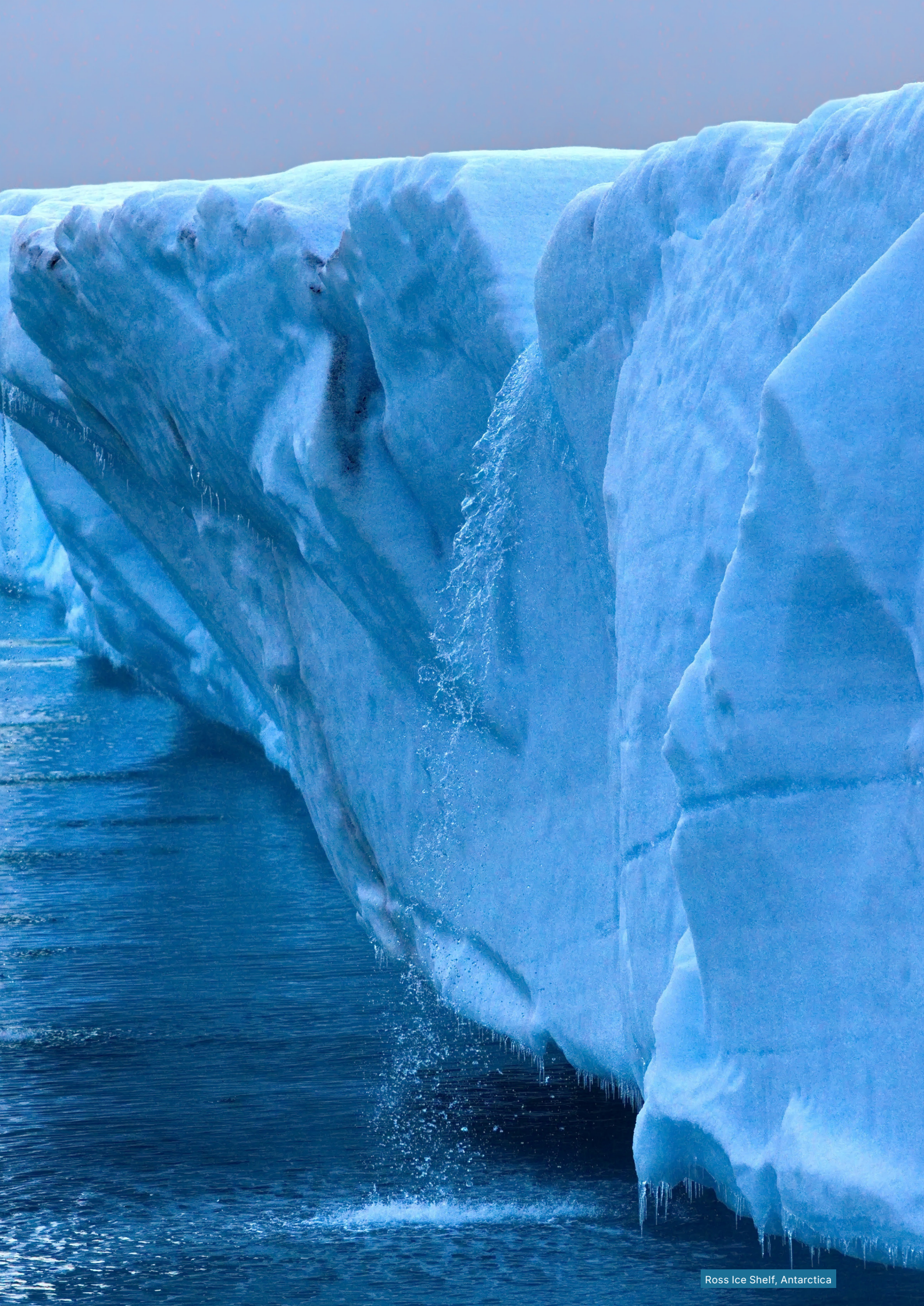
Ross Ice Shelf, Antarctica