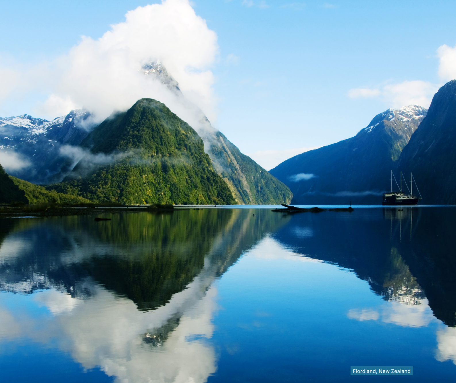
Fiordland, New Zealand