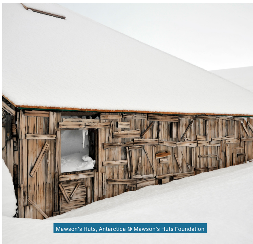
Mawson's Huts, Antarctica

This map is a guide only and is subject to change due to permitting and regulatory approvals; and weather, sea state and other conditions beyond our control.