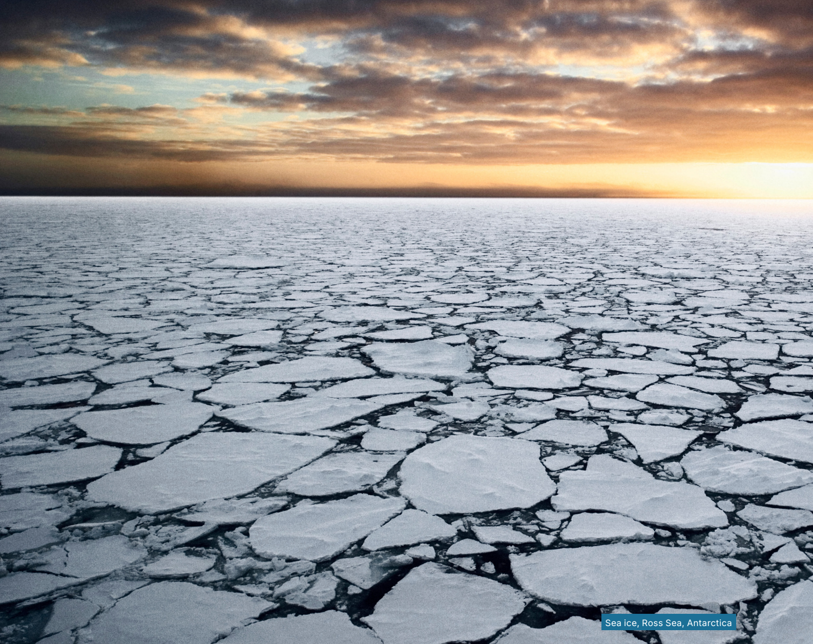
Sea ice, Ross Sea, Antarctica