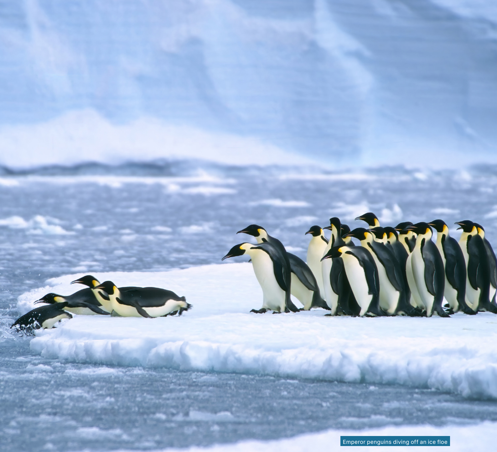
Emperor penguins diving off an ice floe