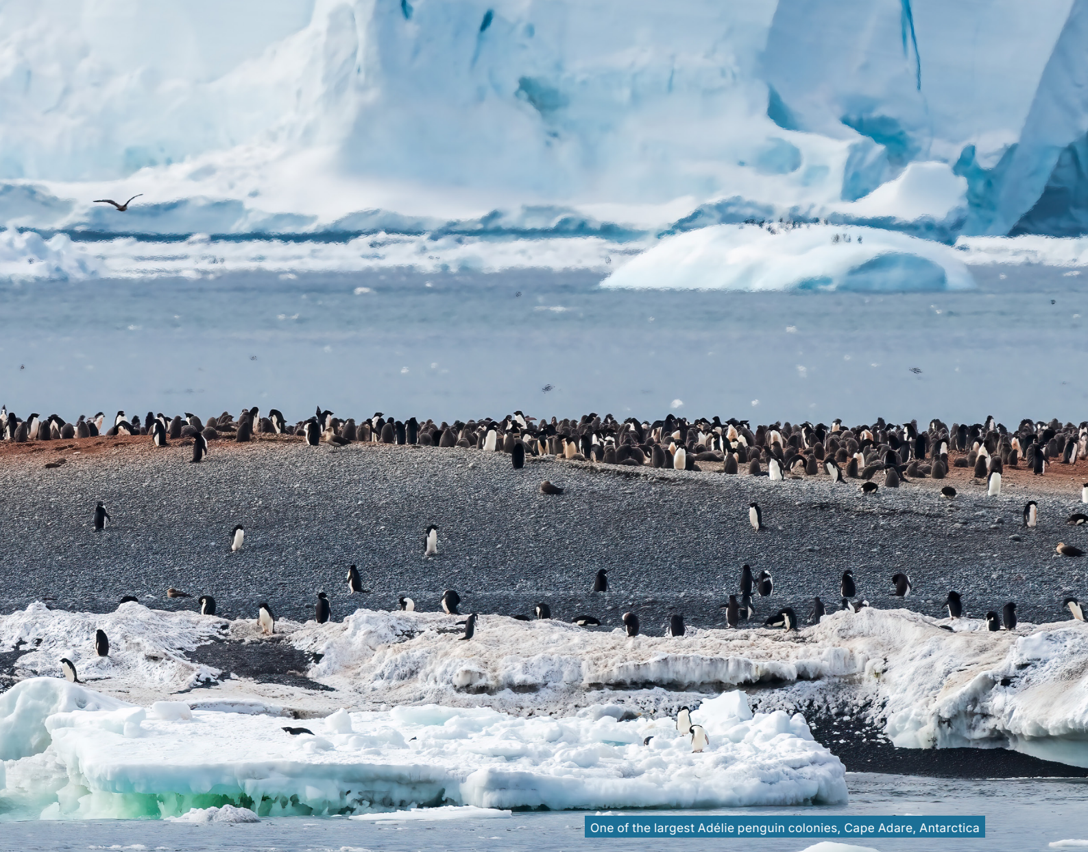
One of the largest Adélie penguin colonies, Cape Adare, Antarctica