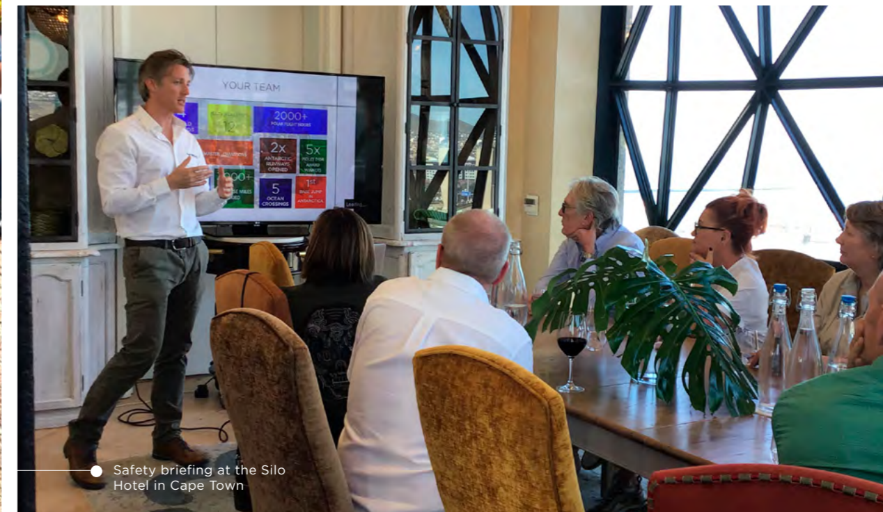
● Safety briefing at the Silo Hotel in Cape Town

Antarctic travel is the only thing White Desert does. It's our passion, it's our mission and it's in our DNA.